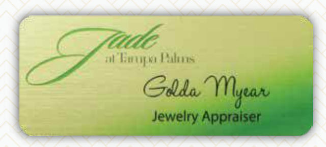
FC-100 - Digitally Printed Badge Brushed Gold/Black Material