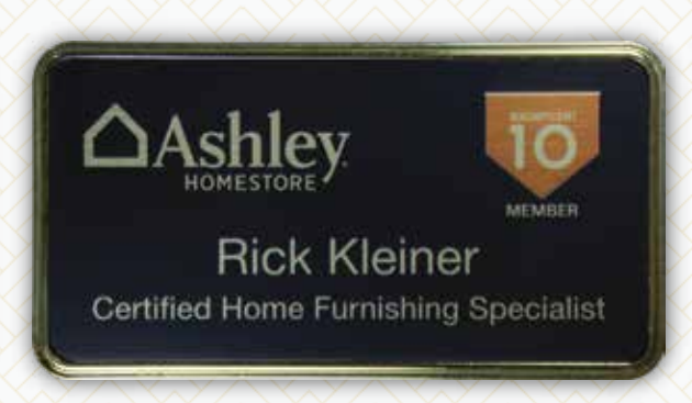
FC-100 - Digitally Printed Badge Brushed Gold/Black Material • Gold Frame