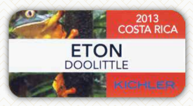
FC-100 - Digitally Printed Badge Mono White Material $ 1/4" Rounded Corners

The price includes a full color logo, up to two lines of personalization, and your choice of either a jeweler's pin or swivel bulldog attachment. Other attachments are available.