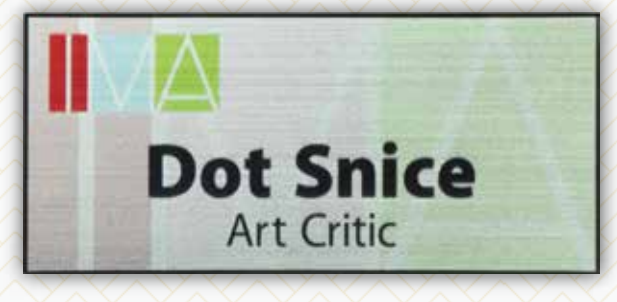
FC-100 - Digitally Printed Badge Brushed Silver/Black Material * Beveled Edges