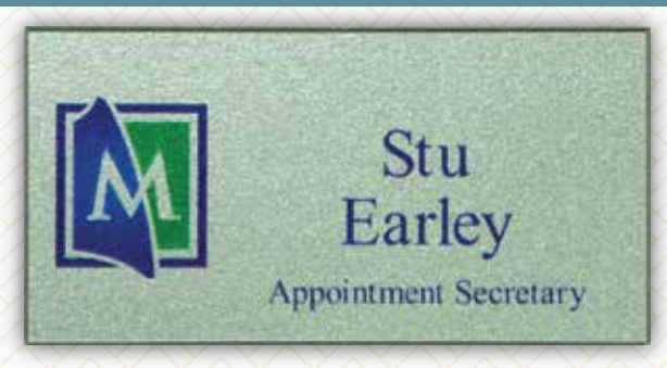
FC-100 - Digitally Printed Badge Smooth Silver Material * Beveled Edges